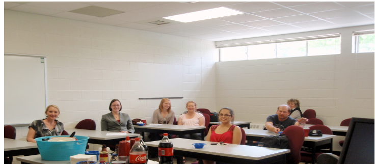
District VII Ice Cream Social at SCC on April 21, 2011.

District VII Director Chairman of the Board wncparalegal@gmail.com